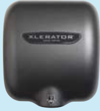
Model XL-GR Surface-mounted, Automatic, Graphite Textured Painted Cover