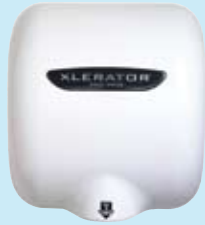
Model XL-BW Surface-mounted, Automatic, White Thermoset (BMC) Cover