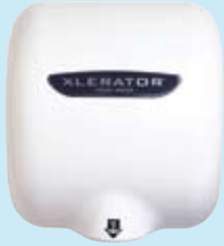
Model XL-W Surface-mounted, Automatic, White Epoxy Painted Cover