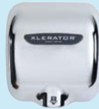
Model XL-C Surface-mounted, Automatic, Chrome Plated Cover