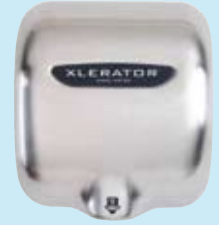
Model XL-SB Surface-mounted, Automatic, Brushed Stainless Steel Cover

Note: Custom Colors Available (visit our web site for more information)